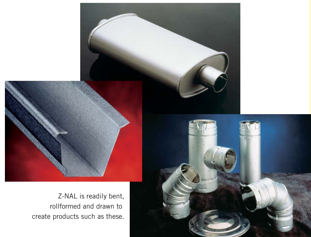
Z-NAL is readily bent, rollformed and drawn to create products such as these.

Although the Z-NAL Plus coating minimizes staining problems associated with wet storage, it is best to keep Z-NAL steel dry in transit. Store clear of the ground, under cover, to prevent water or condensation from accumulating between surfaces. Raise one end to assure drainage. If packs become wet, separate sheets, wipe with a dry, clean cloth and air dry.