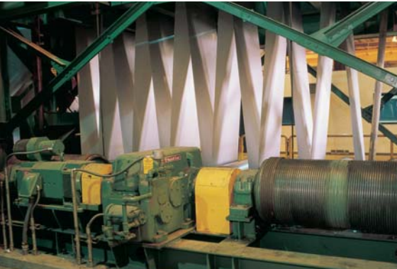
The Z-NAL accumulator tower.