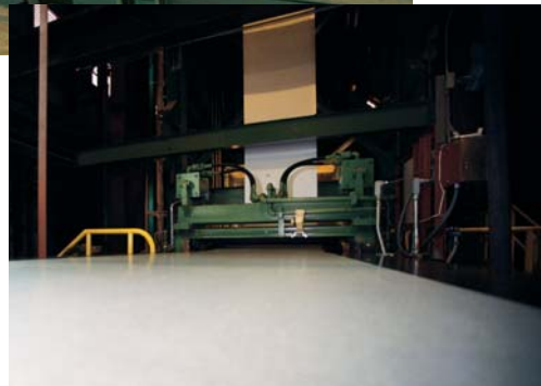
The inspection table on the exit end of the coating line.